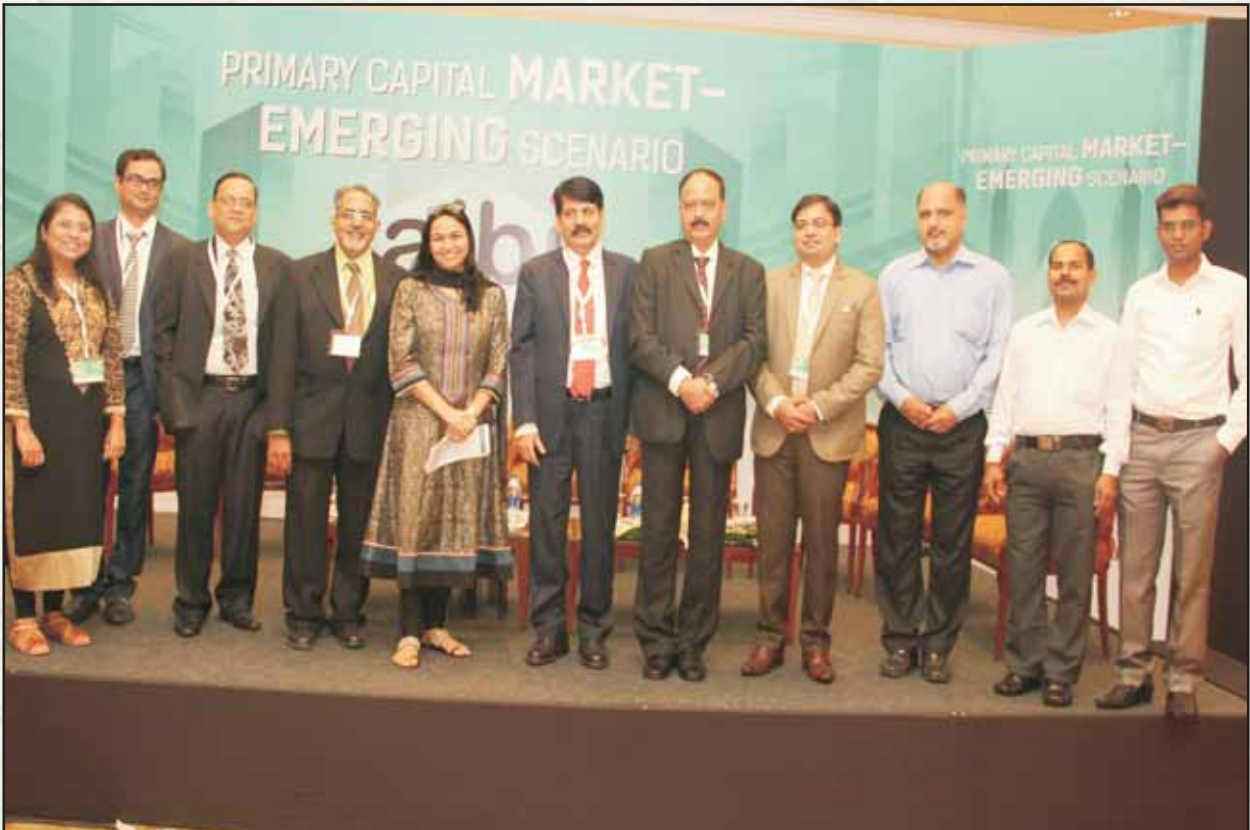
Some of the Board of Directors, Advisor, CEO and other staff members