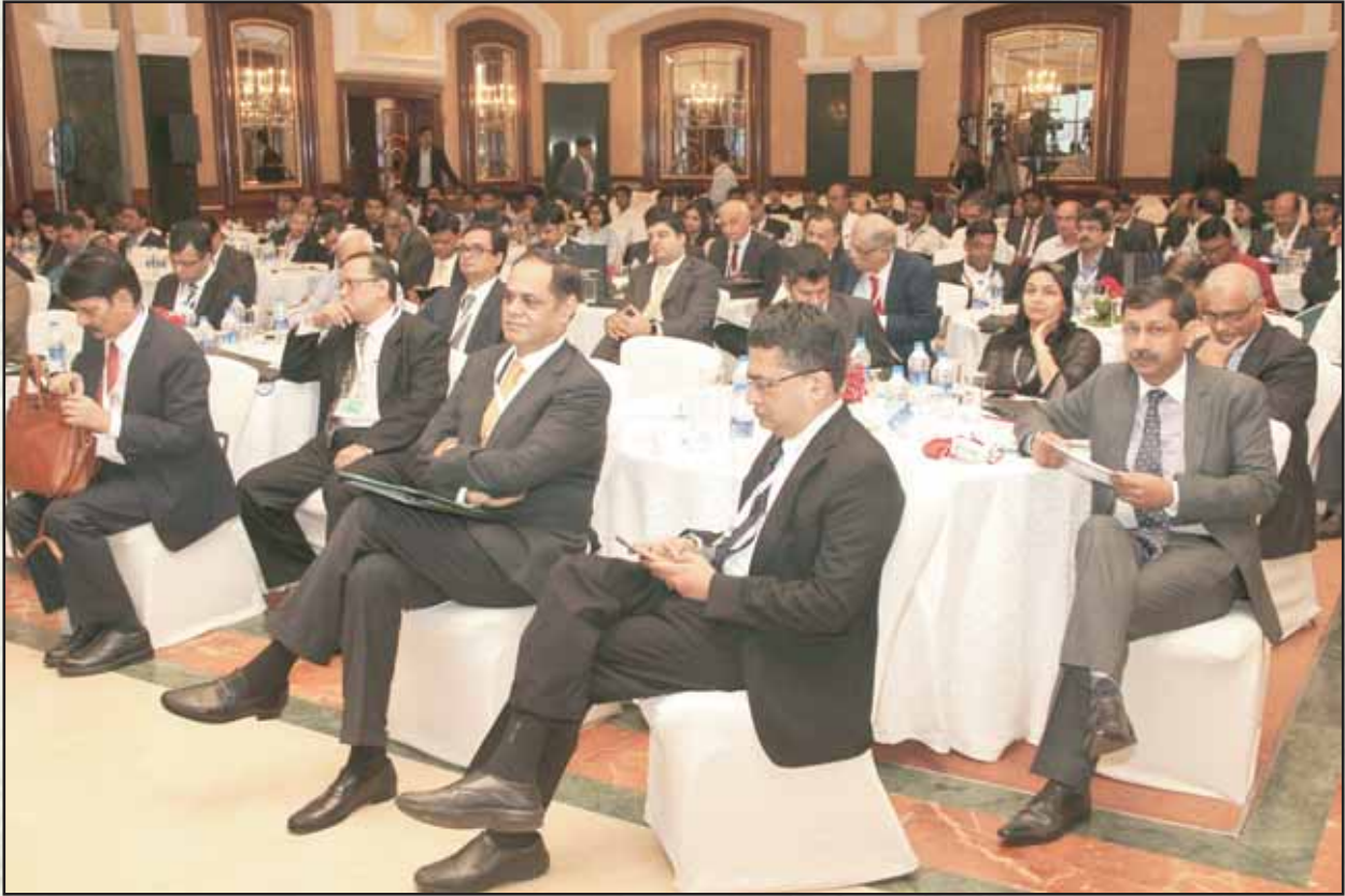
Delegates at the AIBI Summit 2015