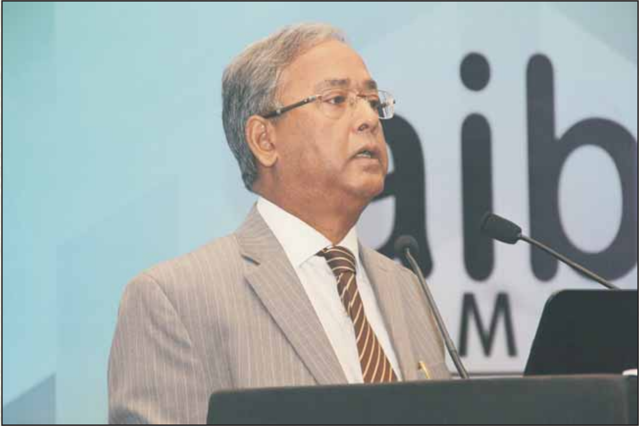
Mr. U.K. Sinha, Chairman, SEBI delivering the keynote address at AIBI Summit 2015