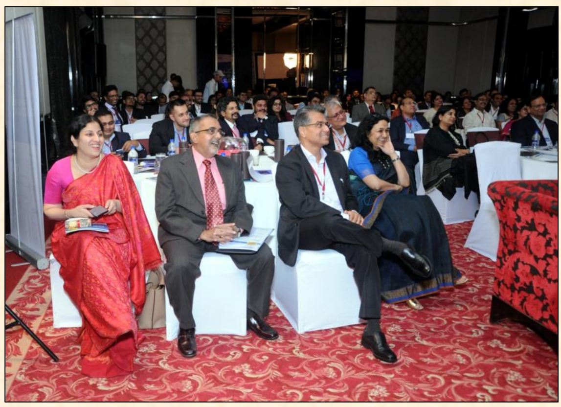
AIBI Summit 2018 – Delegates at the Summit