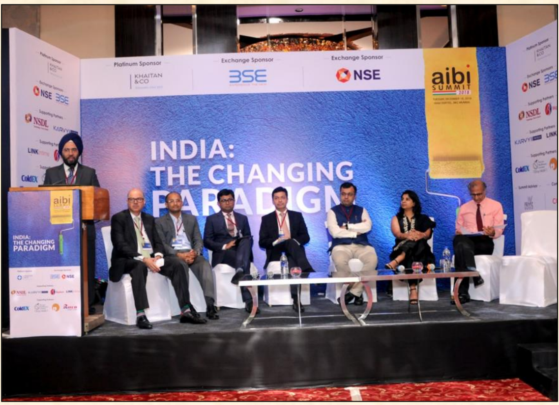
AIBI Summit 2018 – Panel Discussion I -" Regulatory Environment – an Enabler or an Impediment"