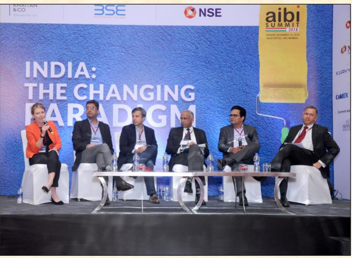
AIBI Summit 2018 – Panel Discussion III -"Technology in Financial Services – A Facilitator or a Disruptor."