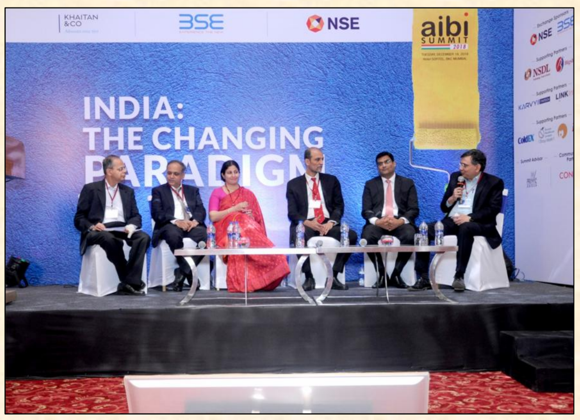
AIBI Summit 2018 – Panel Discussion II -"Indian Economy – The Domestic & Global Influencers"